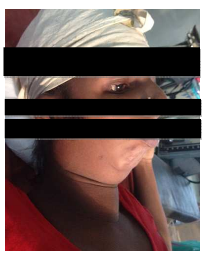
Fig1: Patient with TCS

Systemic examination was normal. On abdominal examination the uterus over distended with was polyhydramnios and a single, mature fetus in breech presentation with fetal heart sounds 138/min. Haematological investigations and renal profile was normal. Ultrasound revealed a single live fetus of 35 wks with BPD 9mm, FL 6.7mm in breech presentation showing micrognathia. AFI 25cm and grade III placenta. Elective lower segment caeserean section was done. A live male baby weighing 2.2 kg with features of TCS was born and admitted in NICU with airway support. The baby died on 1st postnatal day due to respiratory problems. The patient's father was also having the features of TCS.